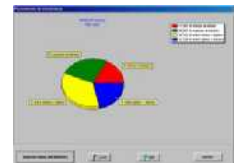
Comparative of Tolerances