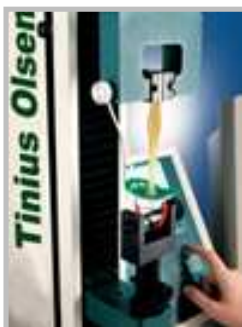
ADHESION / PEEL

¡Tell us about your Measuring and Testing needs...!